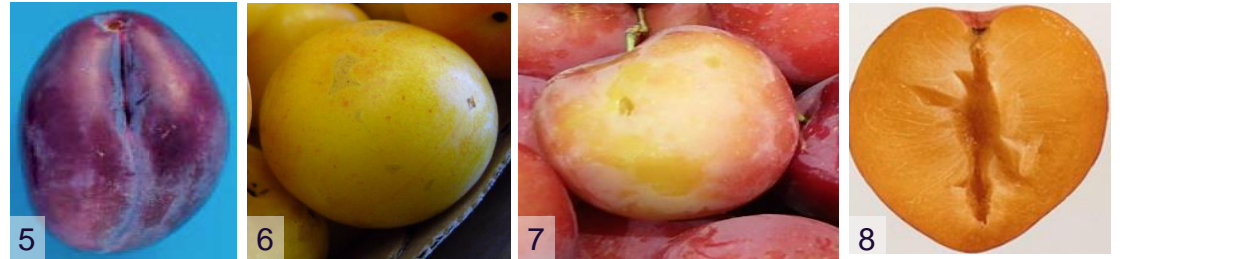
Photo 5: defect in shape Photo 6: skin defects Photo 7: defect in colouring Photo 8: defect in development