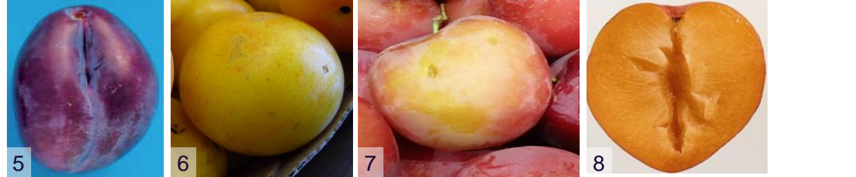
Photo 5: defect in shape Photo 6: skin defects Photo 7: defect in colouring Photo 8: defect in development