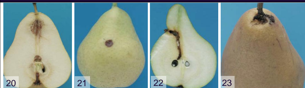
Photo 20: brown flesh Photo 21: rotten pear Photo 22, 23: damage caused by pests