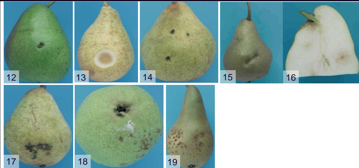
Photo 12: mechanical damages Photo 13: bruising Photo 14: damaged by hail Photo 15, 16: gritty pear Photo 17: scab Photo 19: rough russeting Photo 19: chemical residues