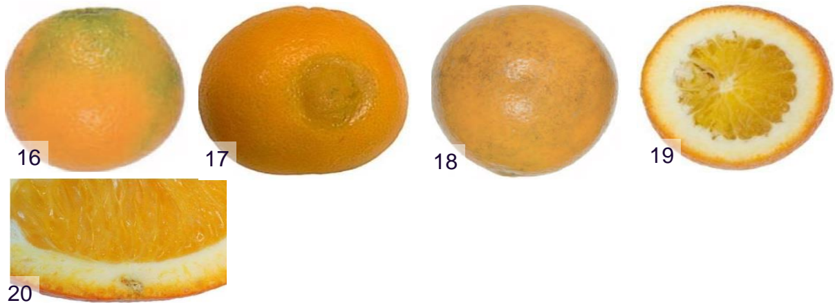
Photo 16: presence of green colour Photo 17: rotten Photo 18: agricultural diseases Photo 19: frozen Photo 20: damage caused by pests