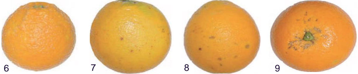
Photo 6: defect in shape Photo 7: sunburn Photo 8: healed defects due to a mechanical cause Photo 9: silver and brown scurfs caused by pest damage