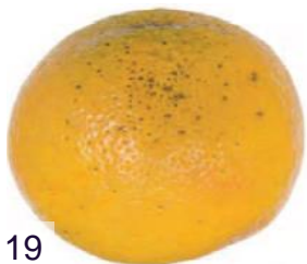
Photo 15: rotten Photo 16,17: damaged by agricultural diseases Photo 18: frozen Photo 19: damage caused by pests