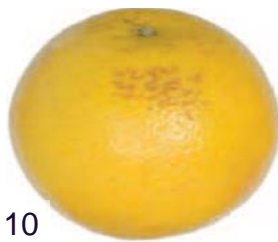
Photo 5: defect in shape Photo 6: sunburn Photo 7: skin defects Photo 8: silver and brown scurfs Photo 9: skin defects caused by mechanical damage Photo 10: rubbing