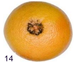
Photo 11: damaged fruit-stalk Photo 12: severe deformation Photo 13: rough skin defects Photo 14: contaminated fruits