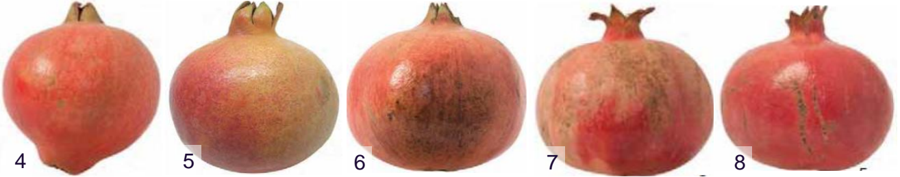
Photo 4: defect in shape Photo 5: defects in colour Photo 6: sunburn not exceeding 1/4 of the surface Photo 7: slight scuff marks Photo 8: slight scratches