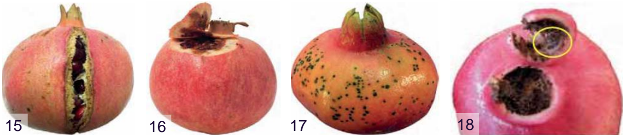
Photo 15: severe mechanical damages Photo 16: rotten Photo 17: agricultural diseases Photo 18: damaged by pests