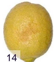
Photo 9: severe defects in shape Photo 10: severe skin defects Photo 11: dieback of styler end Photo 12: rough skin/creasing Photo 13,14: oil spotting