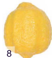
Photo 5: defect in shape Photo 6: healed skin defects Photo 7: silver and brown spots Photo 8: smooth skin