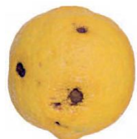
Photo 15: presence of dark green colour Photo 16: frozen Photo 17: damage caused by pests Photo 18,19: agricultural diseases