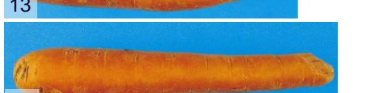
Photo 9: contaminated Photo 10: wooden Photo 11: signs of germination Photo 12: severe cracks Photo 13: deformed Photo 14: broken end