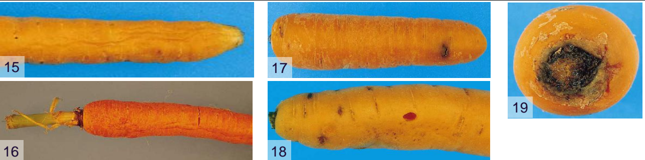
Photo 15: old carrot Photo 16: germinated Photo 17,18: damaged by pests Photo 19: rotten