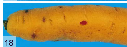
Photo 15: old carrot Photo 16: germinated Photo 17,18: damaged by pests Photo 19: rotten