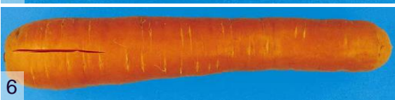
Photo 4: defect in shape Photo 5: defect in colouring Photo 6: healed cracks not reaching the heart Photo 7: scuff marks Photo 8: purple top